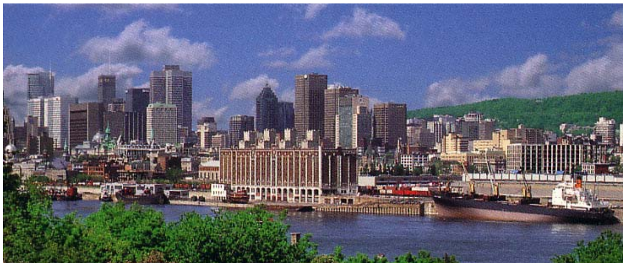
Beautiful Downtown Montreal – situated between the St. Lawrence River and Mount Royal – Home Base for the Jewish Genealogical Society of Montreal

It will be held at the Marriott Marquis Hotel in the heart of the tourist district.