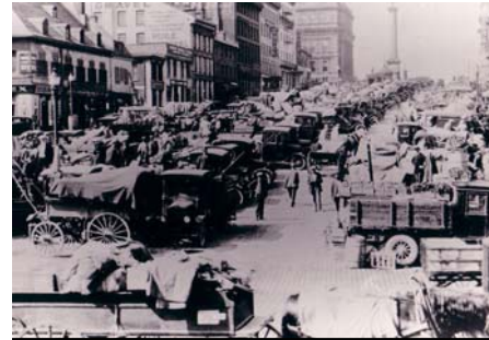
Place Jacques Cartier, Montreal

For this segment of our journal, we invite our readers to submit family anecdotes of life in Montreal – In Days Gone By. These could be stories handed down in your family, or personal memories which give you pleasure as you remember connections between your family and life in this city. A story such as that of -----